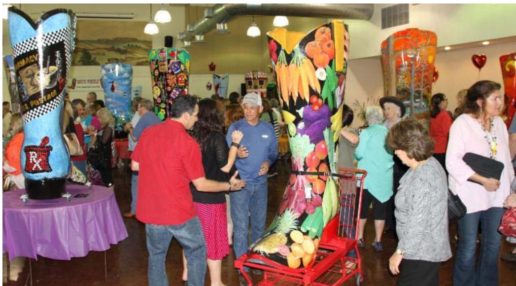
Bootiful Wimberley, a project of the Wimberley Valley Cultural District. Congratulations to Texas' newest cultural districts!

The Commission Initiatives and Designated Funding grants for this quarter include funding received from Target for school performances promoting literacy, and support for the Poetry Out Loud high school competition being held in Texas. The program will provide eight grants totaling $42,500 to eight applicants in seven cities.