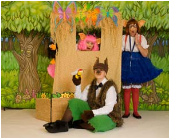
Storybook Theatre of Texas