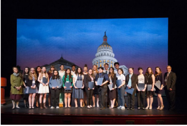
2017 Texas Poetry Out Loud competitors

The Poetry Out Loud recitation contest is a national project of the National Endowment for the Arts and the Poetry Foundation. This exciting program helps students master public speaking skills, build self-confidence, and learn about their literary heritage. High school students memorize poems and perform them in competition. At the state level, the winner and runner up receive cash awards and their school libraries receive money to help them buy poetry books. State winners compete in Washington, DC for a