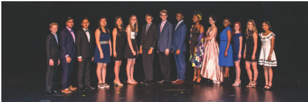
The 2018 Young Masters.